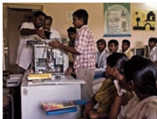
Training helps the rural youth get jobs in the IT sector

Subsequent evaluation demonstrated that this combination of measures was significant in building the resilience of communities to withstand the harmful impacts of drought.